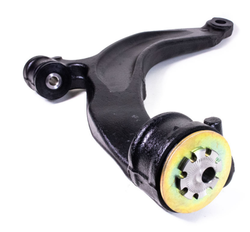
Figure 2 - Fitted